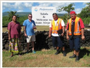
CAD Staff and PASO Inspector during Annual Audits of Savaii Airport

The Regional Safety Office PASO, with assistance from the MWTI-CAD Staff conducted safety audits for all the four (4) airports in Samoa. The audit findings concluded that all airports were operating within the requirements of Civil Aviation Rules Part 139—Aerodromes: Operations, Certification and Use.