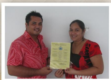
Licensing Team with a copy of the new Air Operator Certificate

During this timeframe, the Air Operator Certificate was amended to meet Annex 6 requirements.