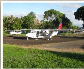
Samoa Air Brittan Norman Islander & Cessna on ground at Maota Airport